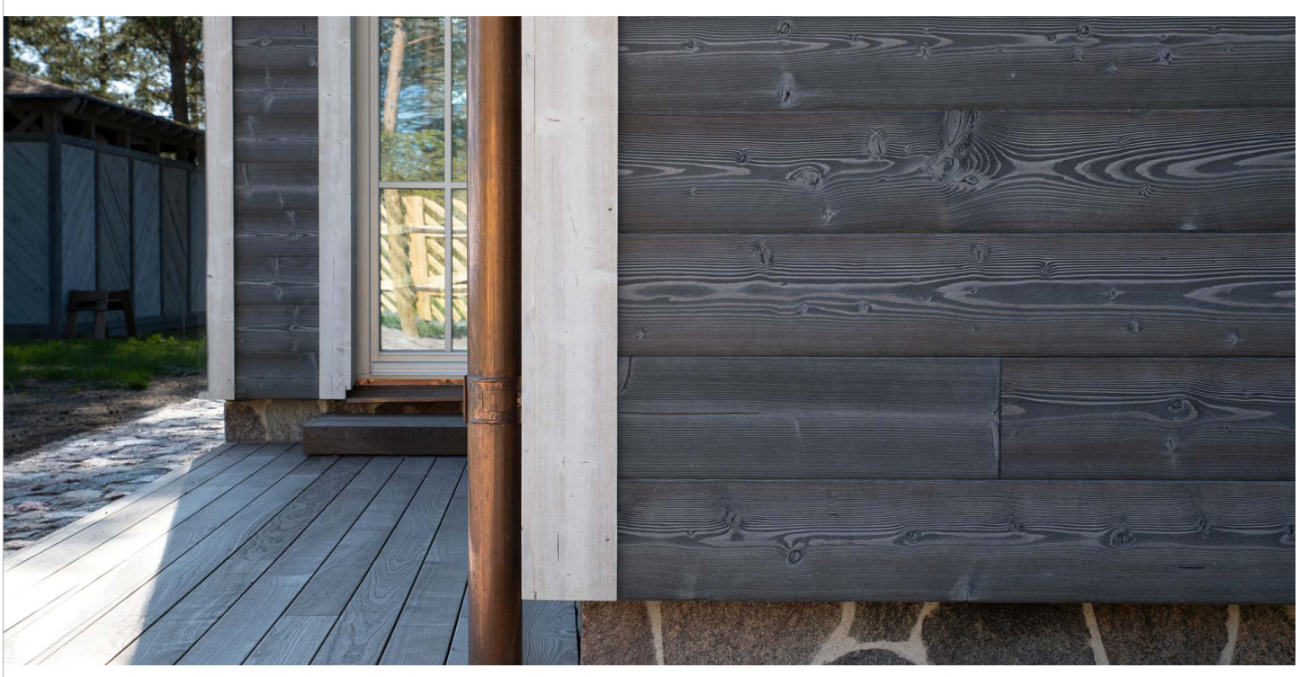
Drift Platinum and Sandy Pearl thermo-spruce cladding. Private house in Estonia