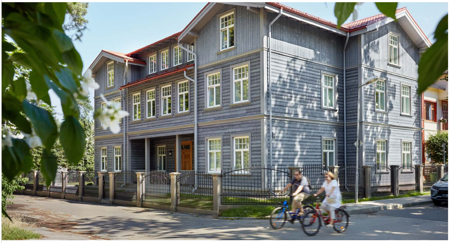
Drift Black Pearl thermo-spruce cladding. Private house in Latvia

0 We recommend leaving Drift cladding to weather naturally rather than repainting it, but if you would like to update your cladding with a fresh new look, it can simply be repainted with any paint that is approved for use on exterior thermally modified wood cladding. Test the suitability of the hue on a small area before applying the finish, and follow Thermory's finishing maintenance instructions.