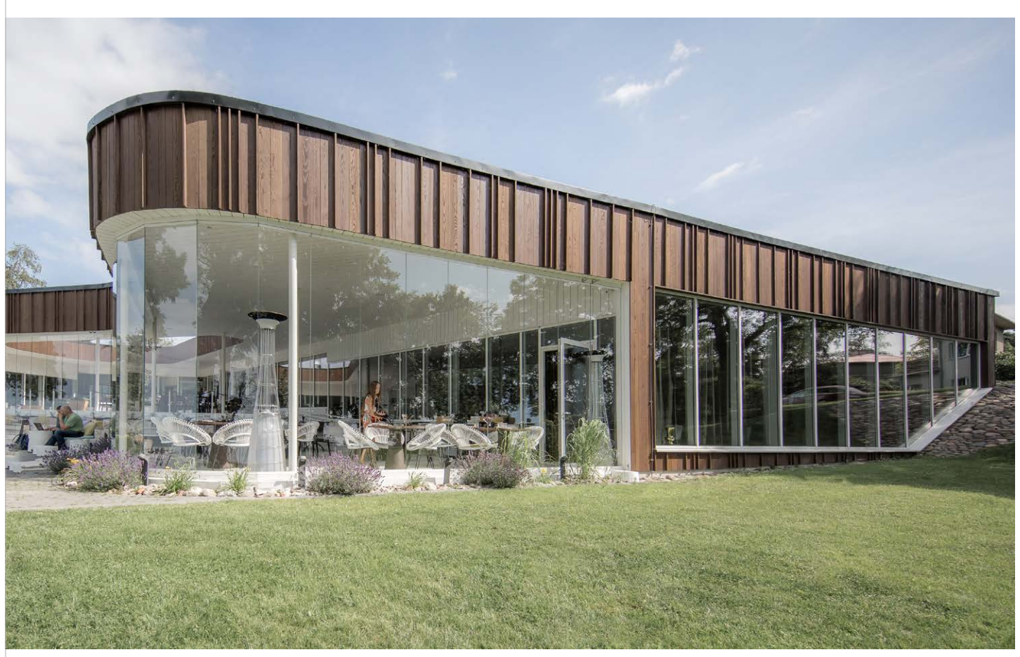
Oiled Thermory Benchmark thermo-ash cladding. NOA Restaurant in Estonia