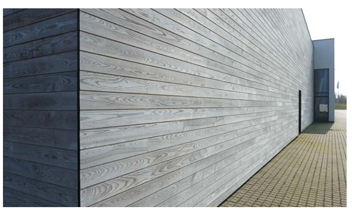
Unoiled Thermory Benchmark thermo-ash one year after installation Denmark

4. Before using a tinted finishing product, mix it thoroughly and test the suitability of the shade on a small area.