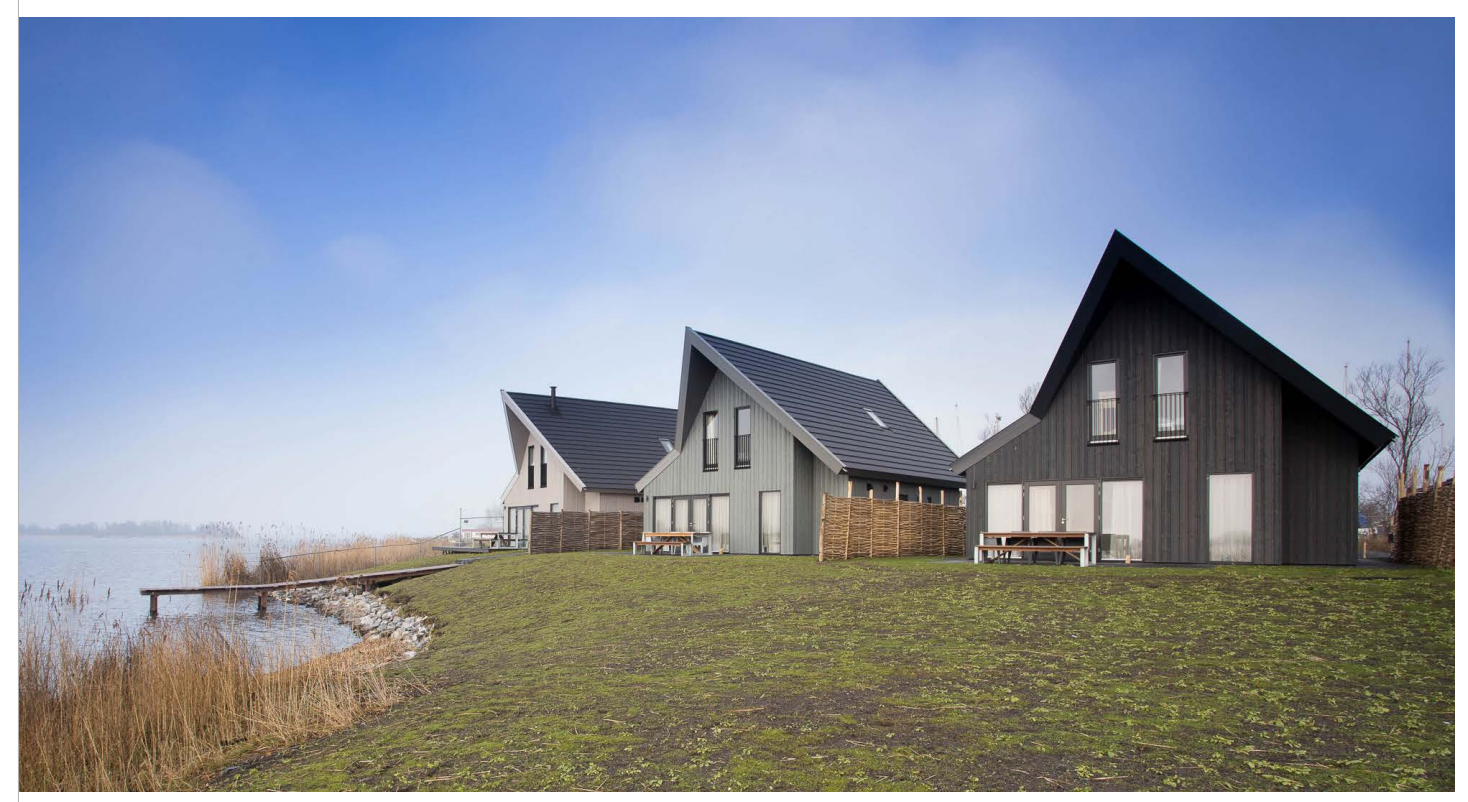
Vivid Opaque thermo-spruce cladding. Holiday Houses in Netherlands Distrubution & Photography InterFaca

For Vivid Opaque 10 cladding, we recommend applying a maintenance finish whenever the paint layer wears down to leave the cladding board with an uneven appearance, and at least every 10 years, with a water-based opaque paint that is approved for use on exterior thermally modified wood cladding.